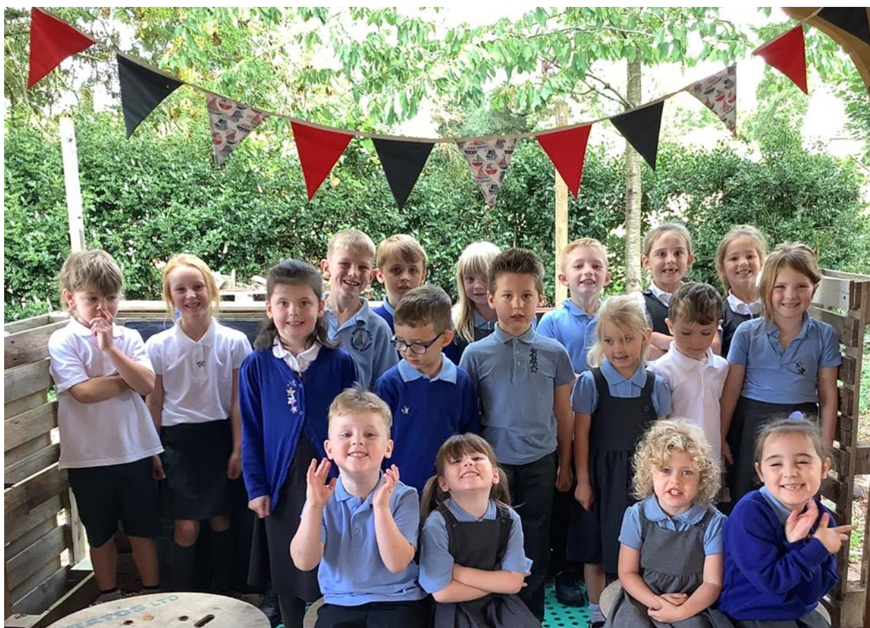
Our new WWC class settling in well.