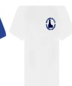
PE T Shirts

As the term comes to an end, please remember the uniform requirements for next year. We expect children to come to school in school colours except where there are special circumstances. The school colours are royal blue, grey and white. The requirements of the uniform are simple and inexpensive. Cardigans, jumpers, t-shirts, pinafores and polo